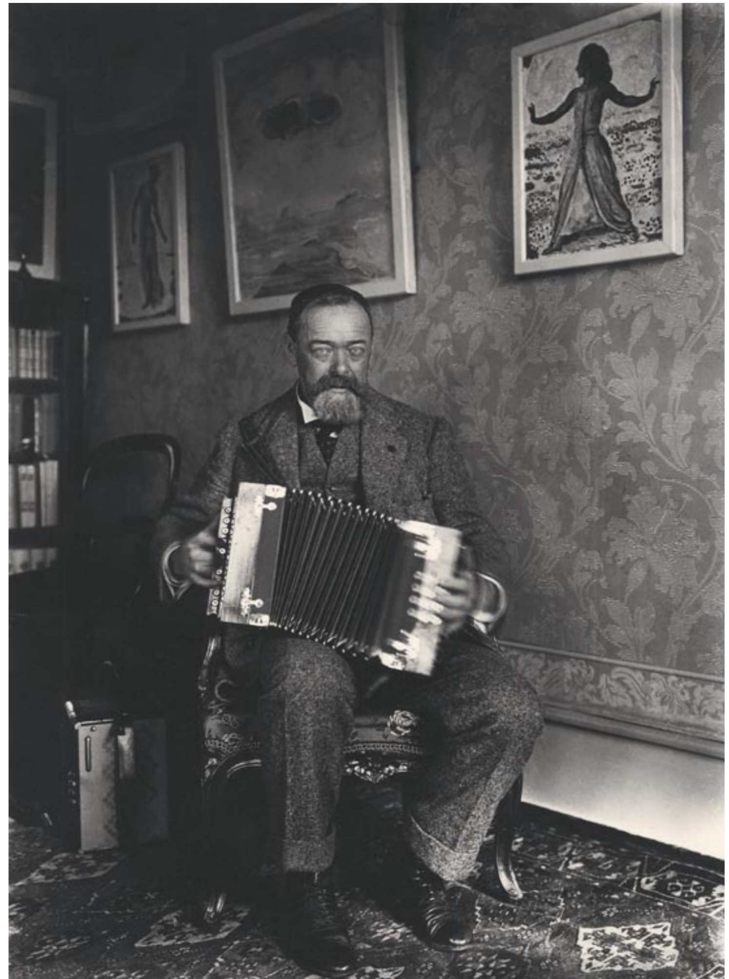
Photo on page 17 Gertrud Müller Ferdinand Hodler with his accordion in the Schanzmühle in Solothurn. Around 1915 (?)

As the following statistics indicate, the success of this ambitious project was achieved by the contribution of numerous people, both within and outside SIK-ISEA, along with the team of authors. The statistics also show how many thousands of references to provenances, literature and exhibitions the authors collated. At last, a clearly laid out reference work is available, commenting on each of the landscape paintings, and addressing questions of genuineness, dating, subject and reception, etc. The online version released in parallel to the book offers an ongoing update of the database and further extends the possibilities for research.